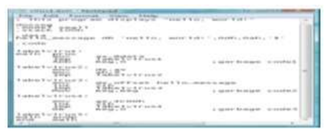
Figure 1: Assembly code of Virus File

The mutating behaviour of metamorphic viruses is due to their adoption of code obfuscation techniques like dead code insertion, Variable Renaming, Break and join transformation. Figure 1 shows the assembly file of the virus code. Computer viruses like polymorphic viruses and metamorphic viruses use more efficient techniques for their evolution so it is required to use strong models for understanding their evolution and then apply detection followed by the process of removal. Code Emulation is one of the strongest ways to analyze computer viruses but the anti-emulation activities made by virus designers are also active [4][5][6][7][8].